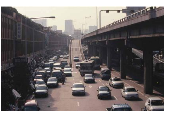
In 1995, Cheonggyecheon was a busy urban industrial centre, which gave rise to problems like noise, air pollution, and traffic congestion.

Seoul was awarded the 2018 Prize for its transformation from a bureaucratic, top-down city into an inclusive, socially stable and innovative city. With rapid urbanisation, Seoul had faced challenges like environmental degradation, and increasing resistance from a citizenry largely left out of planning decisions. The Seoul Master Plan 2030 was a turning point, with its bold move to make citizen participation the norm in urban planning. Seoul built trust with its citizens, assuring them that through engagement, they could shape the future of the city.